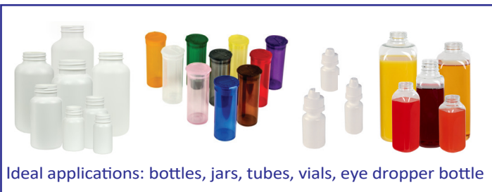
Ideal applications: bottles, jars, tubes, vials, eye dropper bottle